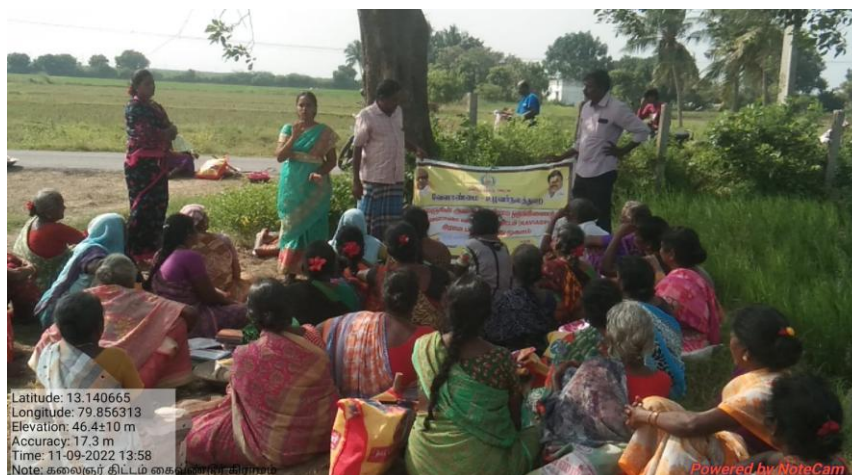
Fig. 3. Distribution and training on nutritive kitchen garden kits to rural women in Kaivandur village by the Department of Horticulture in Tiruvallur district