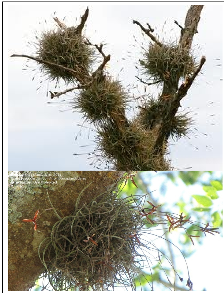
Fig. 1. The epiphyte, ball moss growing on a tree

Tillandsia recurvata L. a flowering plant of the pineapple family Bromeliaceae, commonly called the Jamaican Ball Moss (Fig. 1), the Old Man's beard or Scorn of the Earth is one of the several important medicinal plants found in Jamaica. The plant is an angiosperm (not a moss) and is widely distributed throughout North America, South America and the Caribbean [10]. Ball Moss is an epiphyte that grows mainly on Mango trees, Oak trees and on telephone and electrical lines. Because of the nature of the growth of epiphytes, Benzing [11,12] characterized these plants into two functional groups based on their access to water; continuously supplied and pulse supplied epiphytes. The former comprises of tank bromeliads and taxa of which ball moss belongs, these have access to a constant supply of moisture while the latter group known as the bark epiphytes succumb to water stress if they don't have rain for a couple of hours at a time [11].