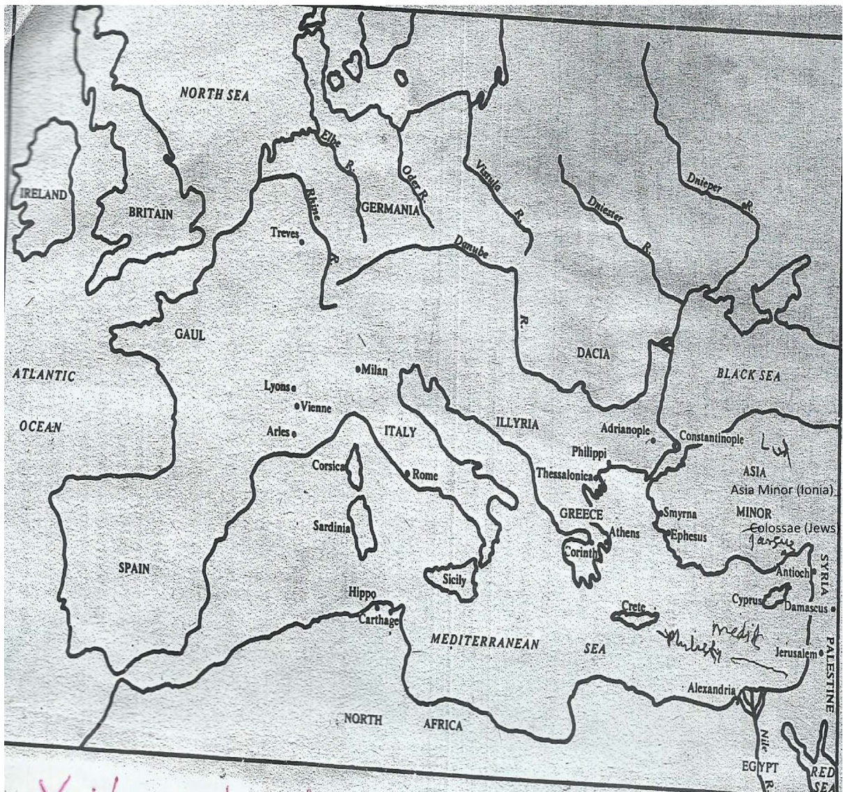
Figure 3. Colossians 2:8 Asia Minor (or Ionia) showing Galatia and Colossae (i.e. New Testament Asia-Minor Boer, 1980) c50CE.