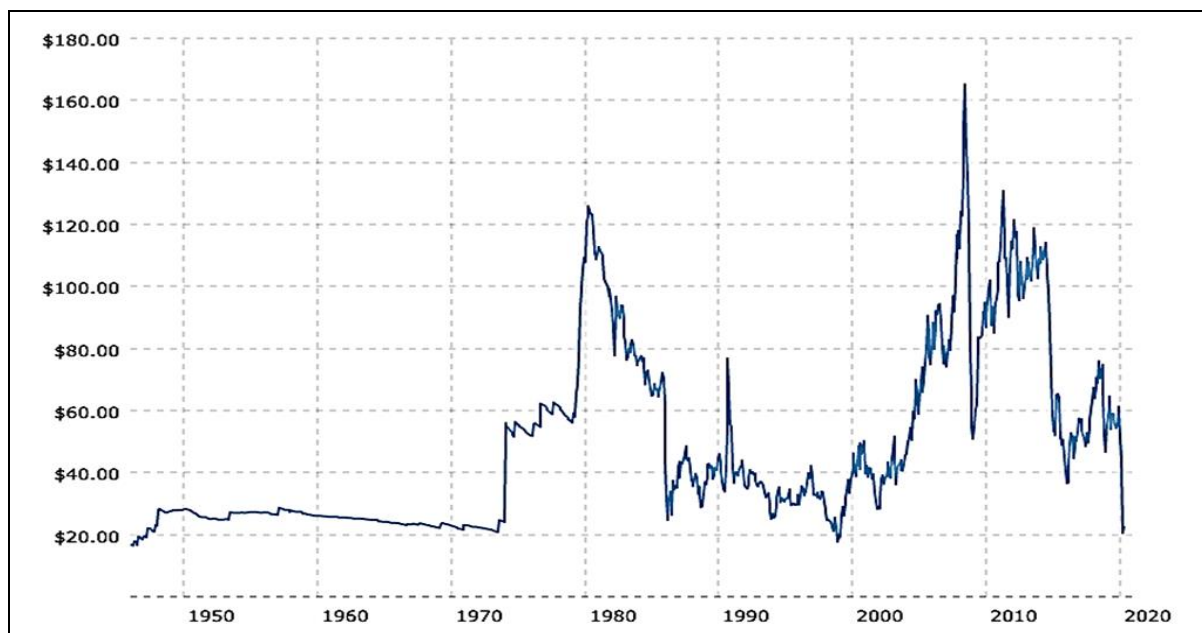
Figure 1. Oil price trend 1950 - 2020 corrected with inflation

A repetition that is never constant but undergoes variations over time, as we have seen at the time of great inflation in the seventies. In those years, the change in the inflation rate was simultaneous with the change in the economic cycle, which obviously was at its maximum coinciding with the two oil crises. A coincidence of the cycle negative peak with the unexpected increases of the oil price, which wasn't due to the emphasis of nominal prices, but to the greater economic instability, which was also linked to the unexpected rise of the oil price.